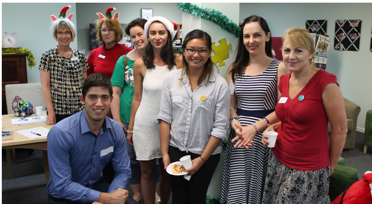
Right Volunteers at Cup Day