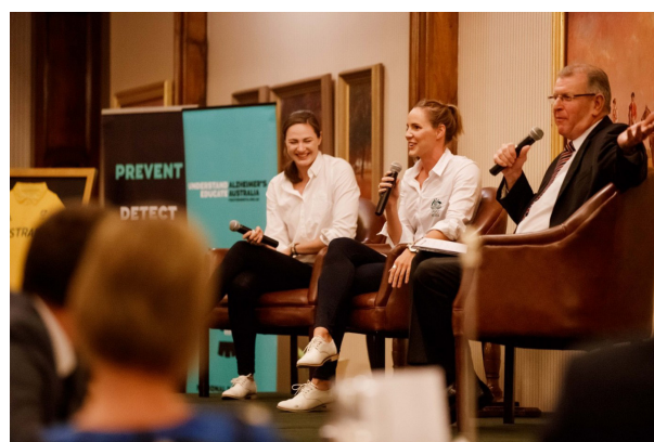
Top and above An evening with Olympic Champions Cate and Bronte Campbell