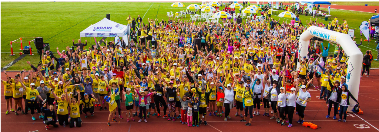
Above and below Getting into the spirit of Memory Walk & Jog