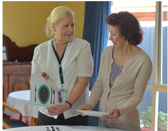
Above Training in action

Our education and training resources ensure our position as the trusted source of information on dementia is maintained for both the general public and health care providers. Contributing to the culture of the organisation, our programs and resources ensure that individuals maintain their wellbeing following a diagnosis of dementia.